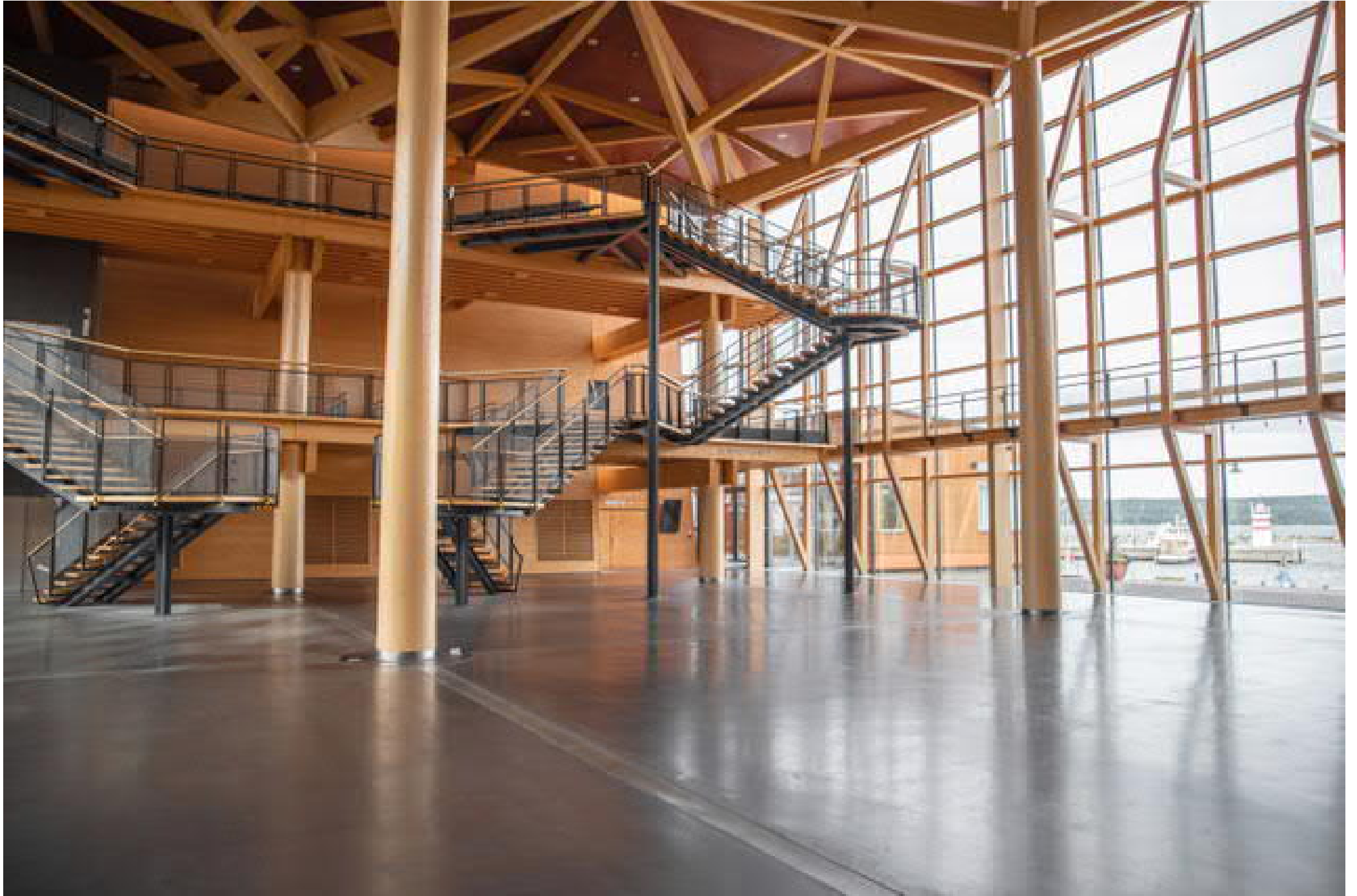
Sibelius Hall, Lahti, Finland - exhibition area overview